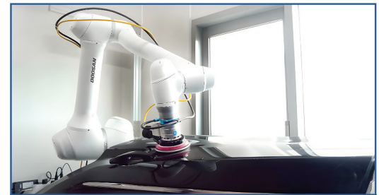
M-Series | Assembly, Machine Tending, Welding, and More