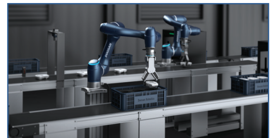
A-Series | Pick and Place, Inspection, Machine Tending