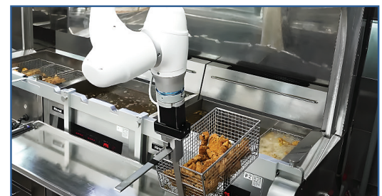
E-Series | Cooking, Fulfills Beverage/Food orders, and Serves