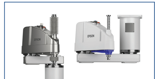
GX10 | Multiple Arm Configurations, Leading-Edge Precision