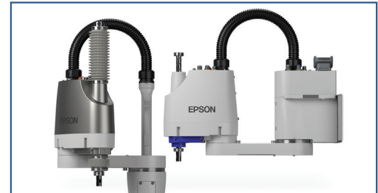
GX4 | Performance, Flexibility and Easy-to-Use Software